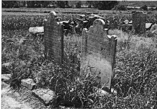
WALL PRIOR TO RESTORATION

The following pictures were taken of the Seifert cemetery during restoration. As these pictures demonstrate, the wall was severely deteriorated.