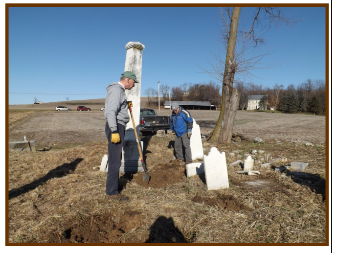
An area was leveled, and prepared, to set up for the Table stones that have been laying in piles for years.