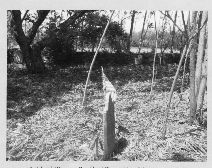
Reichard/Dumm, Rockland Township- After