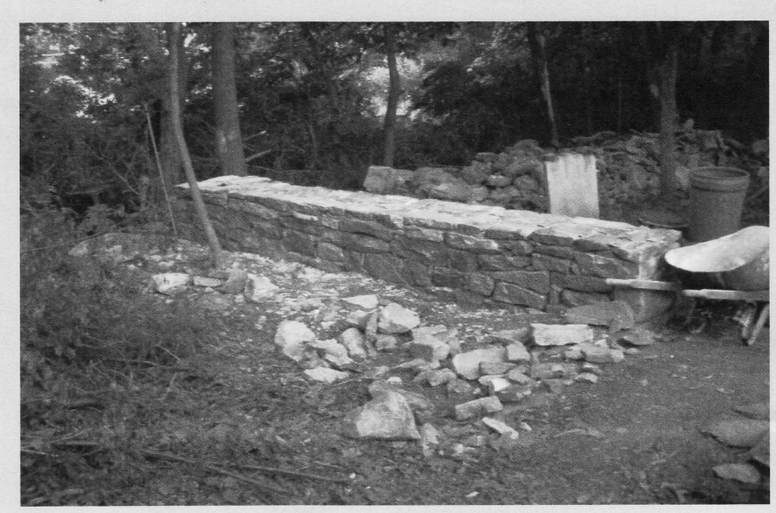
Ruppert Graveyard, Rockland Township