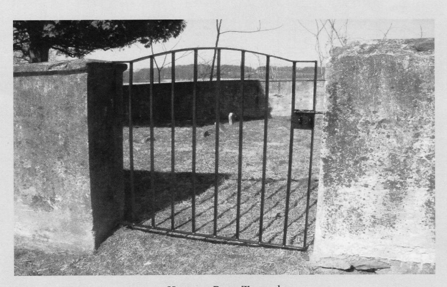
Koenig, Bern Township