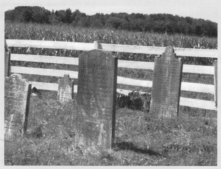
Weiser/DeTurk., Oley Township