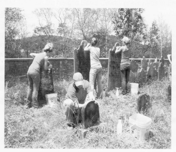
Students used a special treatment solution to clean the tombstones at the Schneider graveyard in Oley Township.