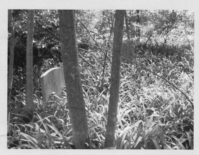
Reichard/Dumm, Rockland Township-Before