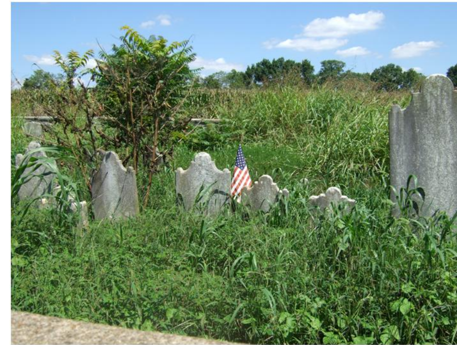
The Schneider graveyard was cleared and in excellent condition back in May 2010 due to the hard work of Oley Valley High School students. This picture (left), taken August 27th 2010, demonstrates just how quickly the site can become overgrown and amount of labor required to maintain these grave sites.