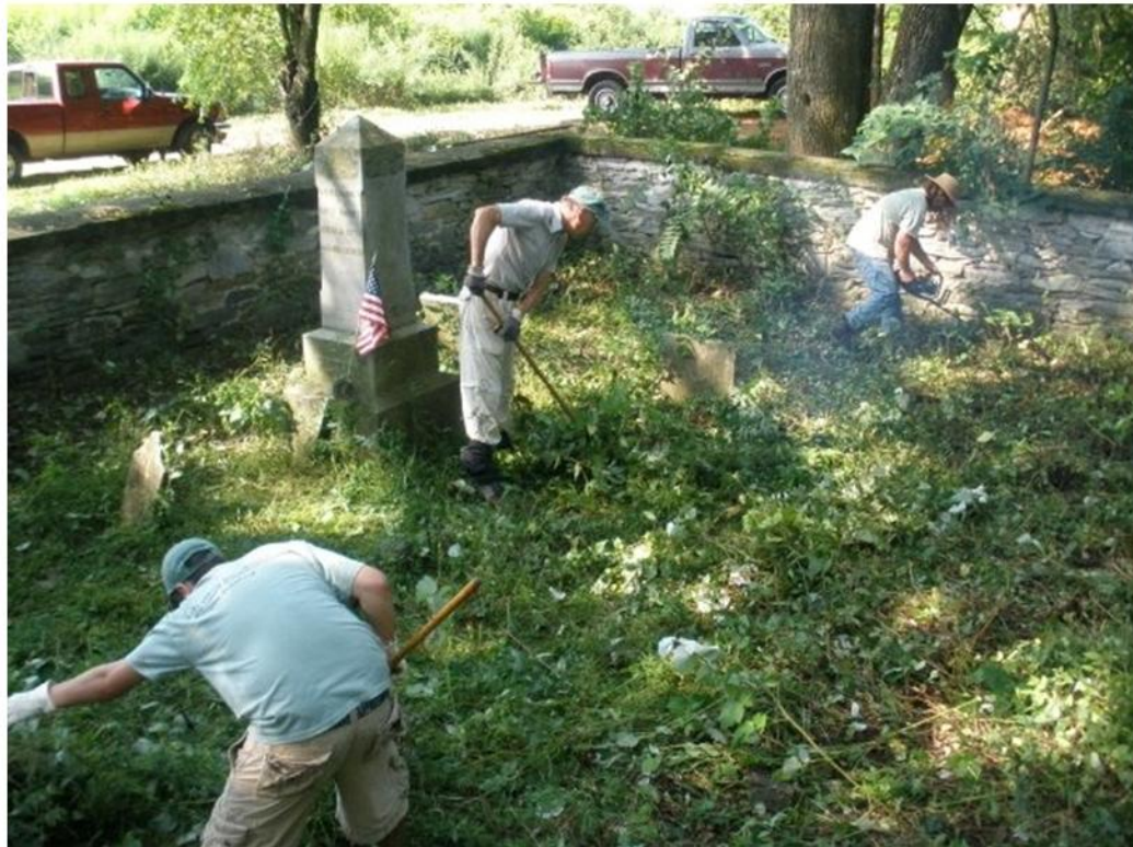
BCAGP members and volunteers raking and pulling weeds recently at the Barnett/Peters graveyard. (Above)