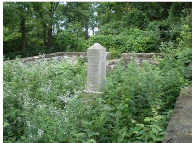
Barnett/Peters as the site appeared before the work party. (Right)