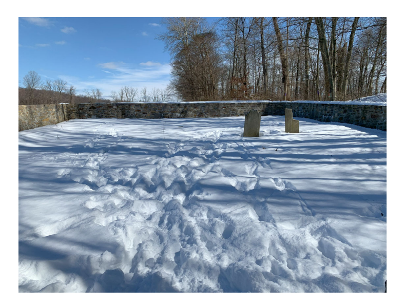
Fetterolf/Bittenbender graveyard in Hereford township

My trip turned out to be very satisfying. My fear of seeing nature winning again was unfounded. All graveyards were in reasonable shape, and two were that way because of concerned locals or descendants. Exactly what BCAGP hopes for all graveyards.