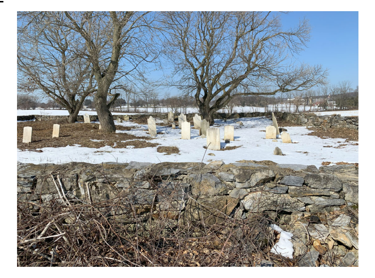
Reichert/Dum (St Henry's) graveyard in Richmond township

My next stop was the Reichert/Dum (St Henry's) graveyard in Richmond township. We have been targeting this site for a Ground Penetrating Radar study and had done a cleanup here last fall. The brush we had collected was left inside the graveyard because there is no place outside the graveyard to put it. We can burn it in the adjacent field but that must be done before planting begins. After we burn it, the graveyard will be clear for the GPR to take place.